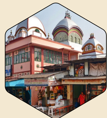
Kali Ghat Temple

6. Kali Ghat: Also known as Kalighat Temple, it's one of the most revered places of worship for Hindus, dedicated to Goddess Kali. The area around the temple is bustling with religious activities and street markets.