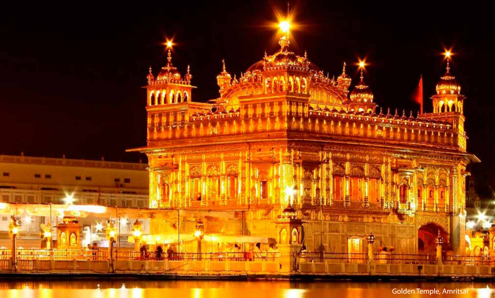
Golden Temple, Amritsar

Serving Indian Grease Industry Since 1997